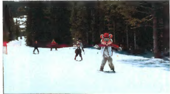
Chuck E. at Ski Santa Fe