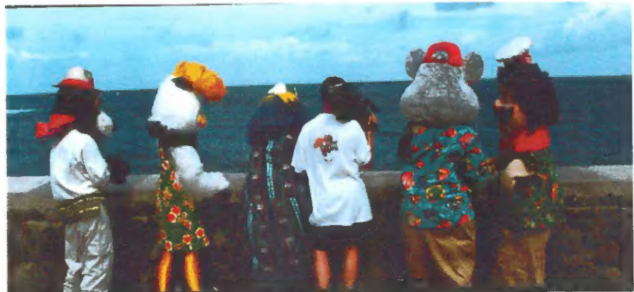
Overlooking "The Blowhole", Oahu, Hawaii

Got show ideas? Email us at cectv@ cecenterentertainment.com